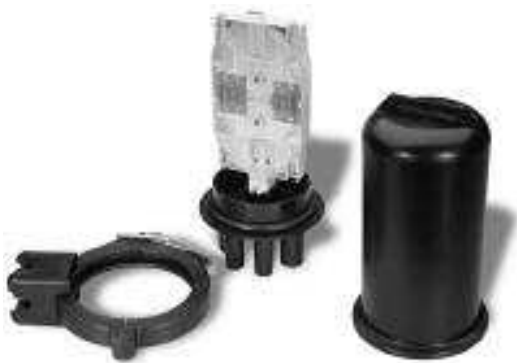
Part Number 140001 12-Fiber Application Ideal where space is limited and 12-fiber or less splices are required.