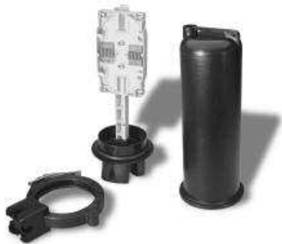
Part Number 140002 24-Fiber Application Accommodates up to 24-fiber splices